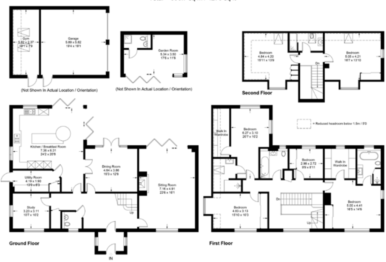
Illustration for identification purposes only, measurements are approximate, not to scale. Imageplansurveys @ 2024

Consumer protection from unfair trading regulations 2008